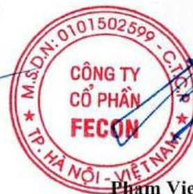
Pham Viet Khoa